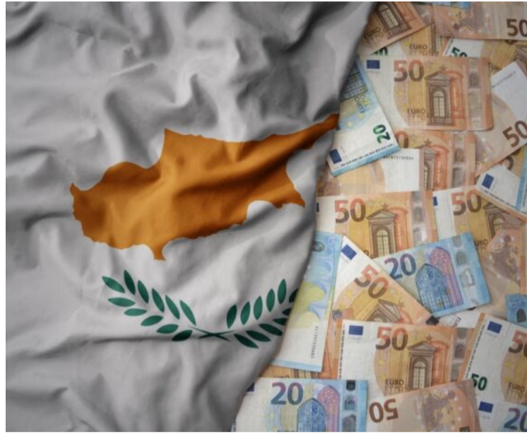
Countries with the most favorable tax policies for investment