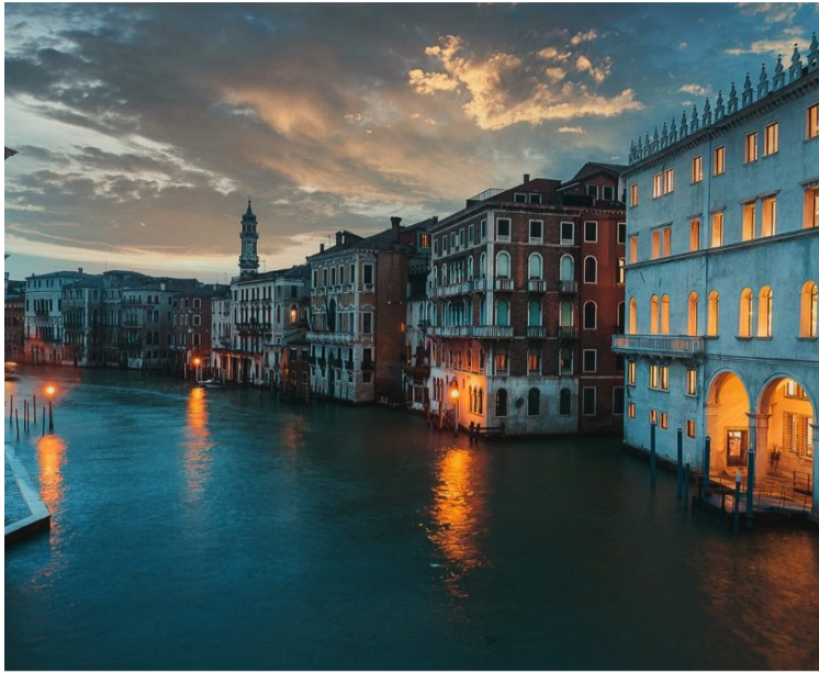
The most promising countries for real estate investment in 2024